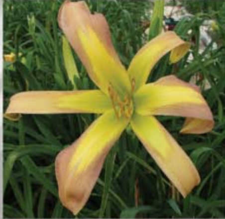
POWERED BY THE WIND - 09 INTRO