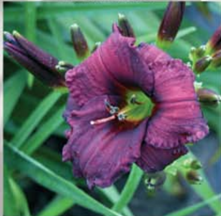
LIL BLACK BUDS