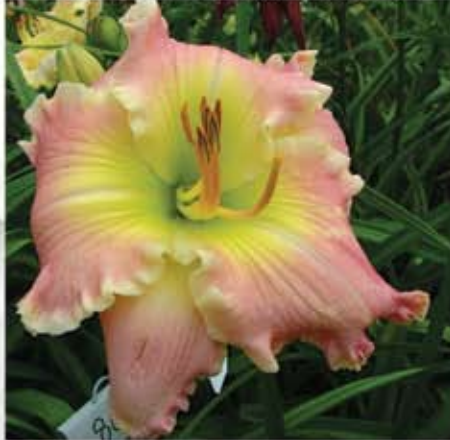
8013 - 08 FIRST BLOOMS