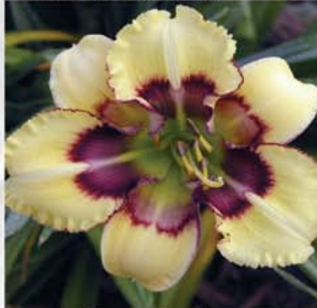
FOCUS ON FUSION