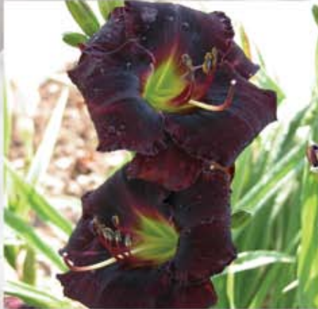
FOR CHOCOLATE LOVERS ONLY