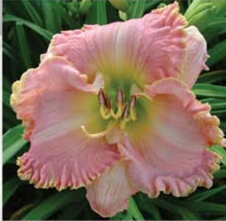
TEQUILA AND TEARDROPS-09 INTRO