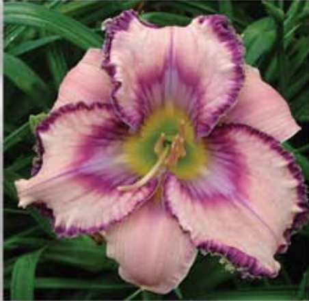
207 - FUTURE INTRO