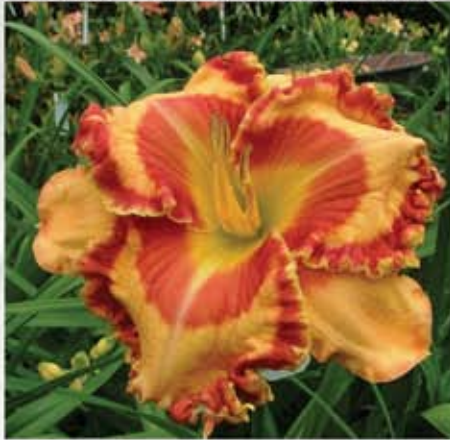
8022 - 08 FIRST BLOOMS