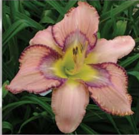
27 - FUTURE INTRO