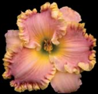
Nekkid Woman Paddling A Canoe