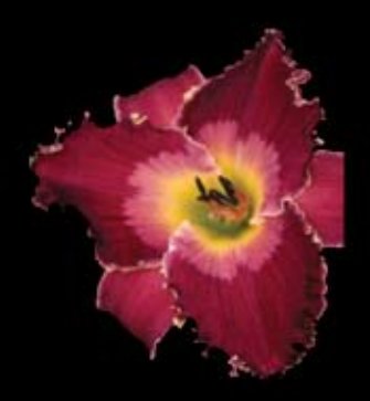
Blackwater Captain Jack