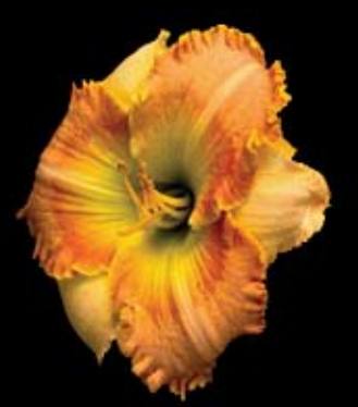
Green Eggs And Ham