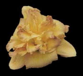
Richfield Muriel's Double