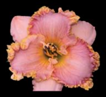
Nekkid Woman Frying Bacon