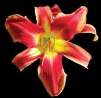
My Heart Belongs To Daddy