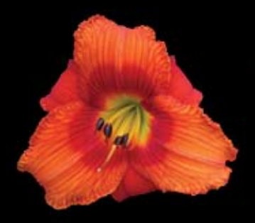
Better Lucky Than Good