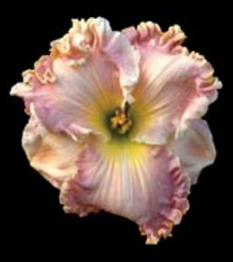
Touched By Graces Hand