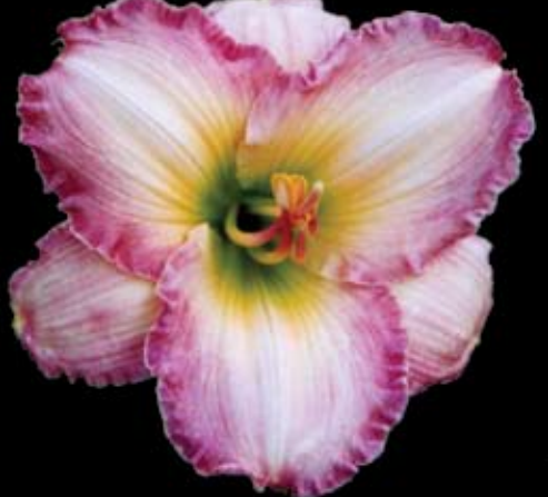
Frosted Vintage Ruffles