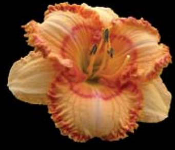
Hippie Crash Pad