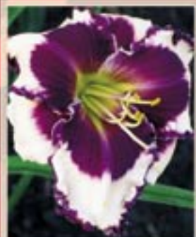
Sabine Baur -Salter- (8)