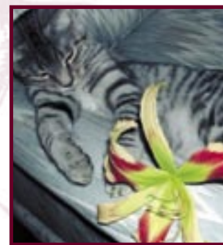
Best Fun Photo, H. 'Wild and Wonderful'