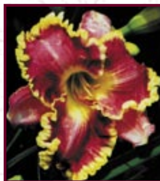
Best Single Bloom, H. 'Alexandra Katherine'