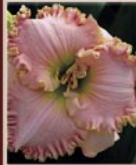
Jacqueline Kennedy Onasis (7)