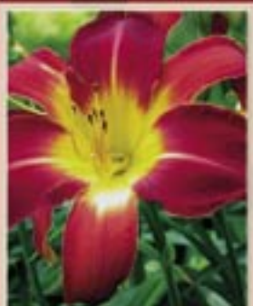
Ruby Spider -Stamile- (7)