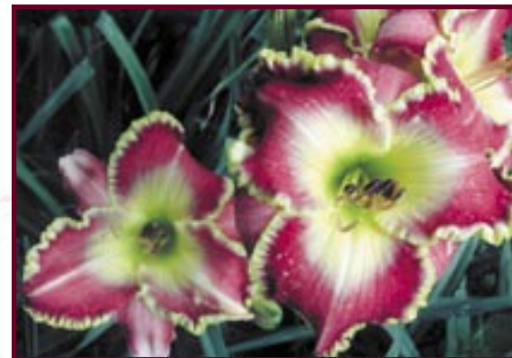
Best Clump, Hemerocallis 'Leaving Me Breathless'

The Ark-LA-Tex Daylily Study Club met on November 19 and selected the winners of their annual photograph contest.