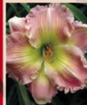
True Pink Beauty -Copenhaver- (6)