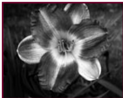
H. ‘ Big Mamou ’

It was in the early 1970s that the Sholars realized that they could no longer properly maintain their large garden. Their extensive Essen Lane property was sold and they moved to another part of town, still keeping a good collection of new cultivars in their new small garden.