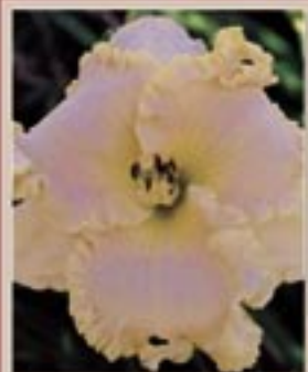
Victorian Lace -Stamile- (7)