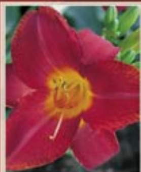
Red Volunteer -Oaks- (7)