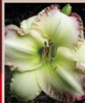
Beautiful Edgings -Copenhaver- (7)