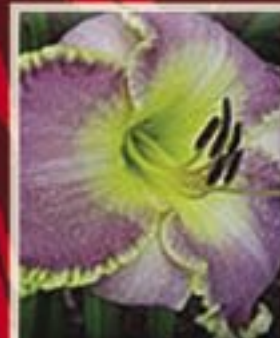
Clothed In Glory -Grace- (6)