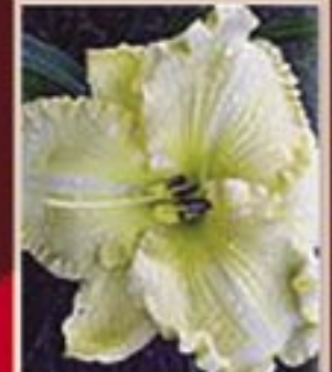
Hot Cakes -Kaskel- (7)