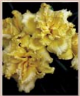
King Kahuna -Crochet- (27)