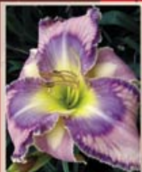
Mildred Mitchell -Mitchell- (7)