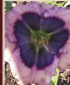
In The Navy -Salter- (7)