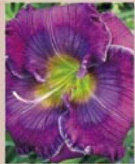
Lavender Blue Baby -Carpenter- (12)