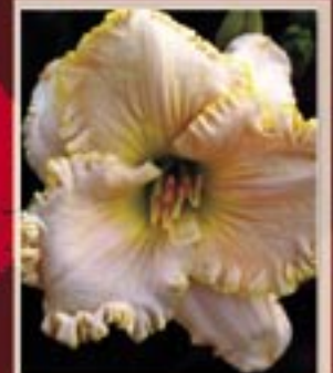
Myrtis Duplantis -Goudeau- (6)