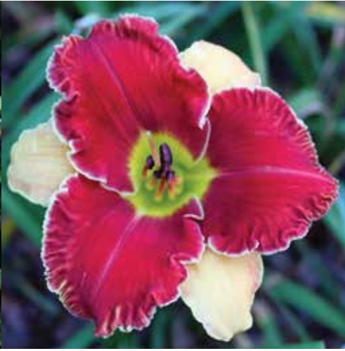
'Whipped Cream and Strawberries'