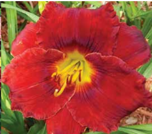
‘Matches and Gasoline’