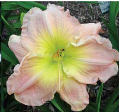
'Jolie Monde' Clarence Crochet