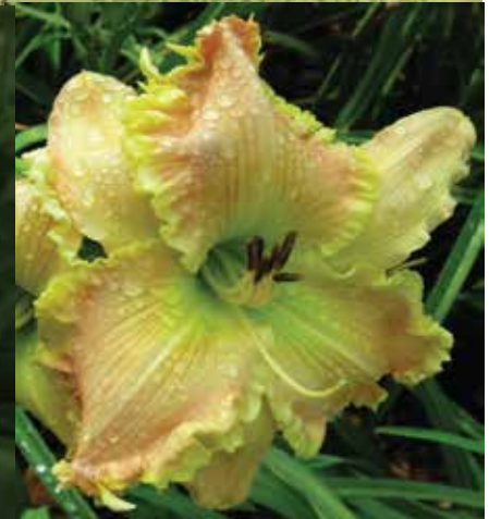
'All Jacked Up' Joe Goudeau