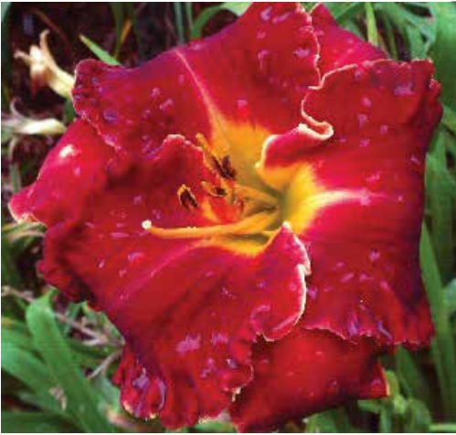
'Branch on Fire'