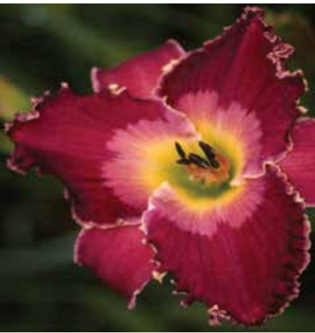
'Blackwater Captain Jack'