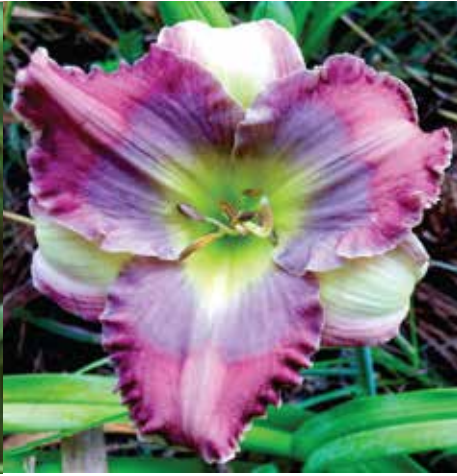
'Everyday Blue Jeans'