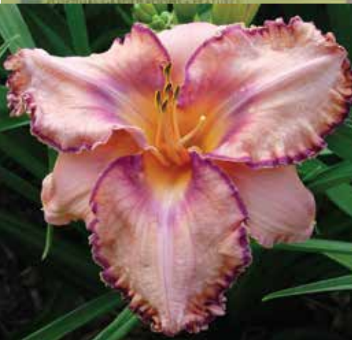
'Alex Sheets' Clarence Crochet