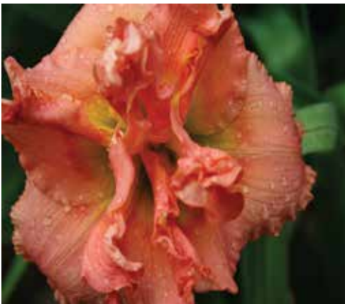
'LillyLand's Melon Sorbet'