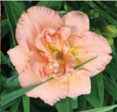
'Siloam Double Classic'