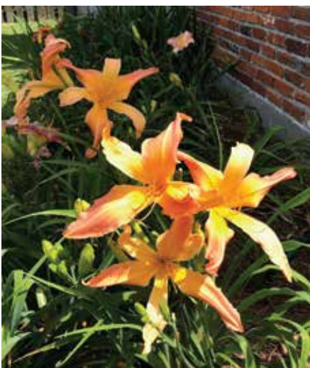
‘Nekkid Woman Doing a Jiggy Dance’