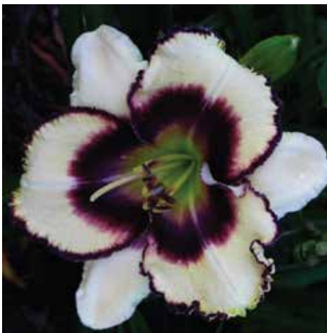
'Tiger Bait' Ginger Goudeau