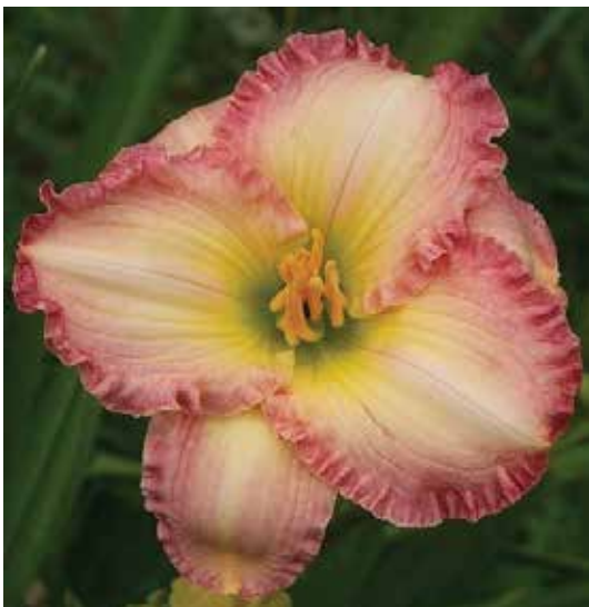
'Frosted Vintage Ruffles'