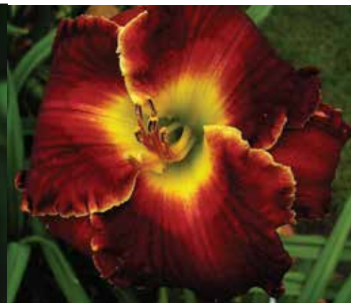
'Red Heat Resistor'