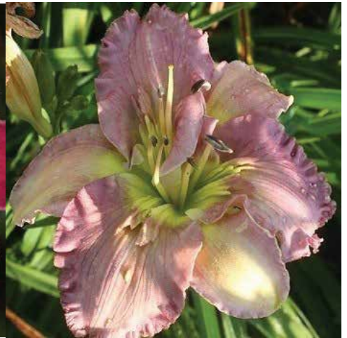
'Wooster Mind Craft'