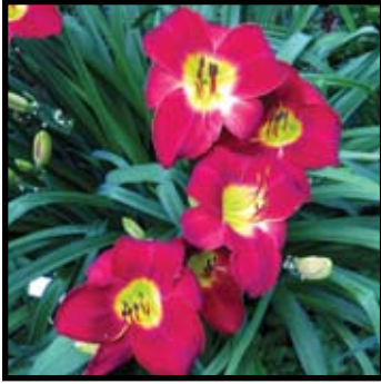
h. 'Big Apple'