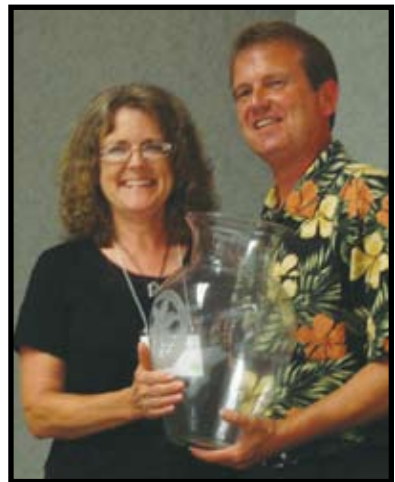
Emma Middlebrooks Award