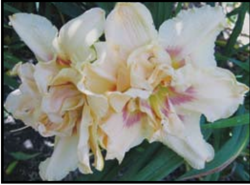
h. 'Mary's homecoming'

concentrates on doubles and unusual forms with Joiner's H. 'Big Kiss' being one of her favorites. Though a little tattered from the night's storms many looked fantastic. My favorite was an eight inch unusual form best described as mulberry.