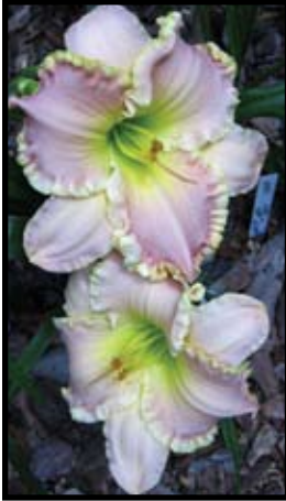
h. ‘Nekkid Woman Paddling a Canoe’