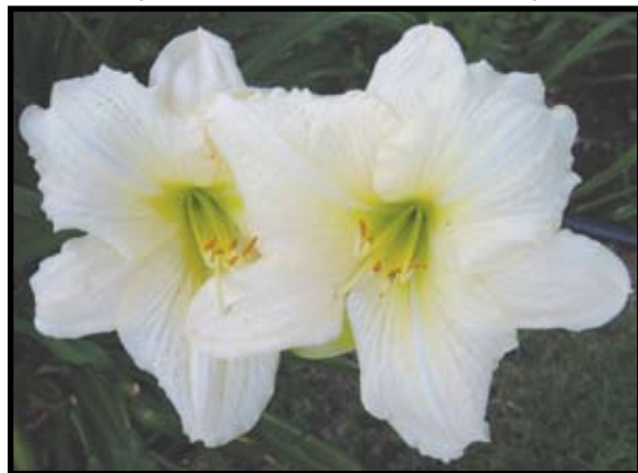
h. 'Joan Senior'

As I approach the garden the large stone lined beds come into view. It took several minutes to figure out that the gazing balls that adorn the garden are actually color coded to match the color of the beds. There are white beds, yellow beds, pink beds, red beds etc. In the white bed I found two perfect blooms of H. 'Joan Senior' .