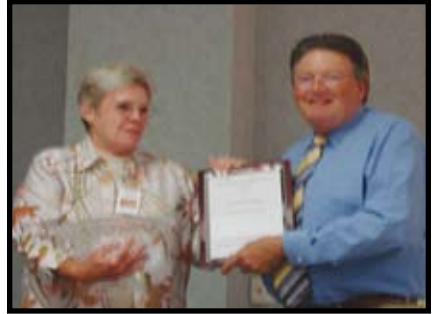
Pauline Henry Award