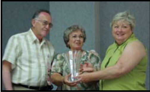
Hilda Tot Ratliff Award