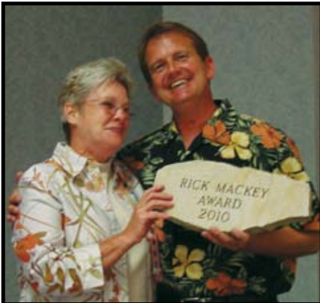
Rick Mackey Award