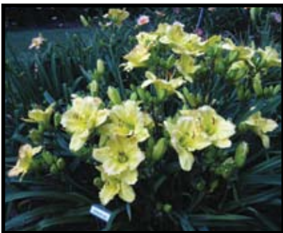
h. 'Smuggler's Gold'

The entrance to the house has 3" thick huge Arkansas Flagstone pavers some of which measure six feet across. On either side of the front door are two western style totem poles. One looks like an Indian you would see in front of a cigar shop.